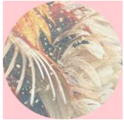
CORNELIA KLARA, PARIS – SALZBURG 2019 ST. LEONHARD #2 DIGITAL C-PRINT SIZE 19.68 X 19.68 INCHES 50 CM X 50 CM EDITION 1/3