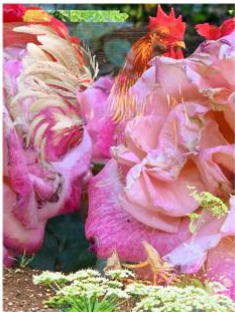
CORNELIA KLARA, PARIS – SALZBURG 2019 TIFFANY DIGITAL C-PRINT 35.82 X 21.65 INCHES 91 CM X 71 CM (IMAGE 29.52 X 21.65 IM / 75 X 55 CM) EDITION 1