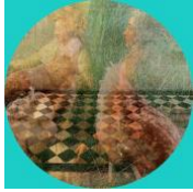
CORNELIA KLARA, PARIS - SALZBURG 2019 ST. LEONHARD #1 DIGITAL C-PRINT SIZE 19.68 X 19.68 INCHES 50 CM X 50 CM EDITION 1/3