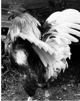
CORNELIA KLARA, PARIS – SALZBURG 2019 ST. LEONHARD DIGITAL PRINT BLACK & WHITE 50.39 X 39.37 INCHES 128 X 100 CM EDITION 1