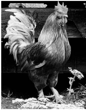
CORNELIA KLARA, PARIS – SALZBURG 2019 THE HULL DIGITAL PRINT BLACK & WHITE 50.39 X 39.37 INCHES 128 X 100 CM EDITION 1