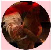
CORNELIA KLARA, PARIS – SALZBURG 2019 ST. LEONHARD #3 DIGITAL C-PRINT SIZE 19.68 X 19.68 INCHES 50 CM X 50 CM EDITION 1/3